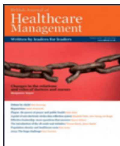
British Journal of Healthcare Management